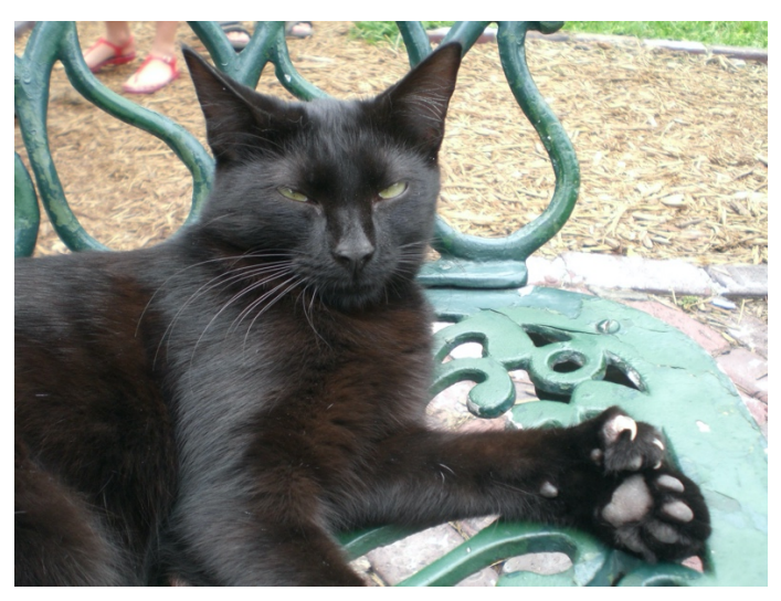
RR: From the Hemingway House on Key West?